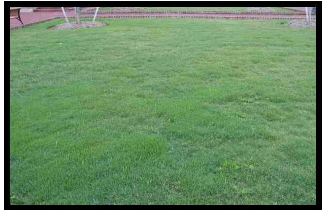
(Warm Season) Grass —Bermuda