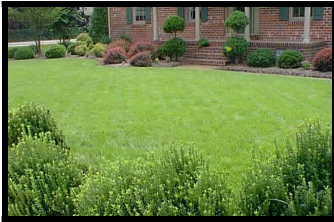
(Cool Season) Grass—Fescue